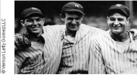
Bill Dickey, Lefty Gomez & Lou Gehrig